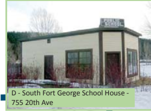
D - South Fort George School House - 755 20th Ave