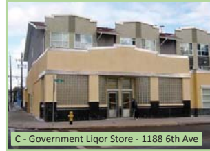
C - Government Liquor Store - 1188 6th Ave