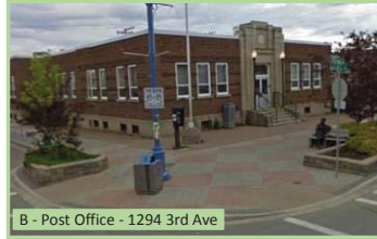
B - Post Office - 1294 3rd Ave