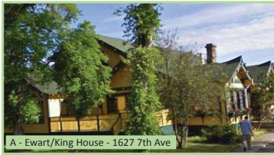
A - Ewart/King House - 1627 7th Ave