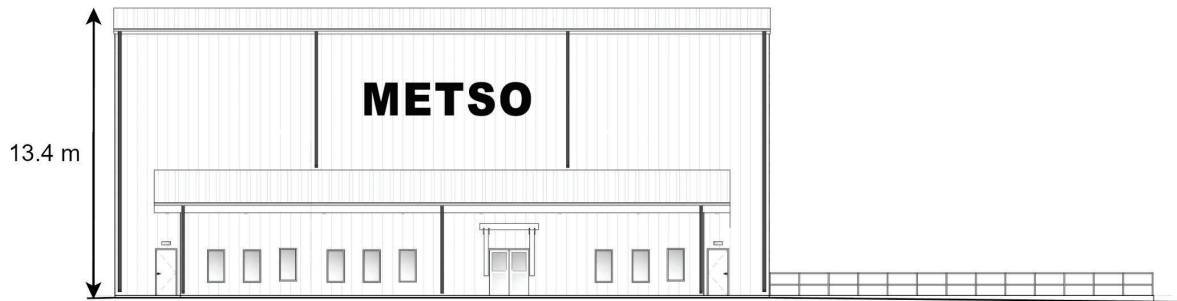
METSO WEST EXTERIOR ELEVATION

Vary Section 12.2.5 2. of the City of Prince George Zoning Bylaw No. 7850, 2007 as follows: a) Increase the maximum height from 12.0 m to 13.4 m.